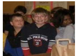
ANNOUNCEMENTS, COMMITTEES & GROUPS pages 5—6