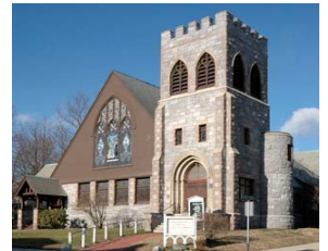
SUNDAYS AT UU MEDFORD page 3