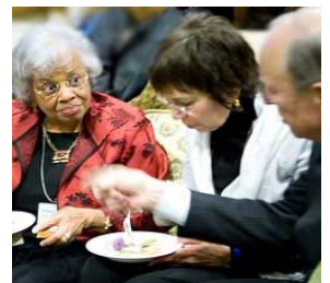
FEBRUARY AT A GLANCE page 4