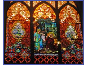
MOXIE page 2