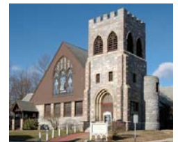
SUNDAYS AT UUCM page 3