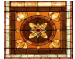
MOXIE page 2