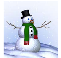
FEBRUARY AT A GLANCE page 4