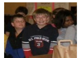
COMMITTEES & GROUPS pages 6-8